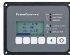
Standard PowerCommand 1.1 control operator/display panel