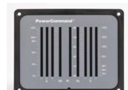
Optional AC output analog meters