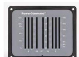
AC output analog meters - Optional